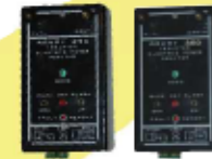
RK 250 RK 350 FENCE MONITORS

RK 250 High Voltage Independent Fence Monitor. RK 350 Low Voltage Independent Fence Earth Monitor.