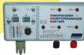
ENERGISER PERFORMANCE METER

The Energiser Performance Meter (EPM) measures the peak output voltage and pulse energy delivered to a connected load by a pulse type electric fence energiser. This information is displayed in the form of: